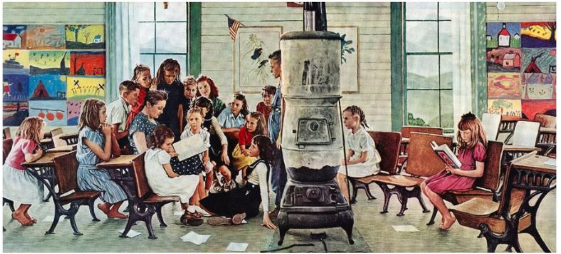
Norman Rockwell Visits a Country School copied from The Saturday Evening Post