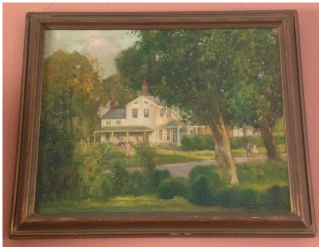
Corwin Knapp Linson - painting c. 1910