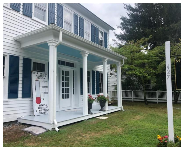
Lightning Jack's Foundation - painting c. 2023