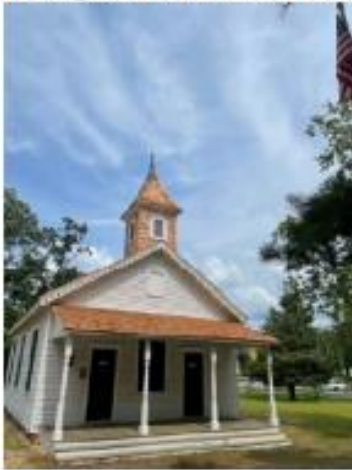
Georgia Road Schoolhouse

Georgia Rd & Jackson Mills Rd, Freehold Twp