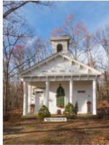
Ardena Public School No 2

Georgia Rd & Jackson Mills Rd, Freehold Twp