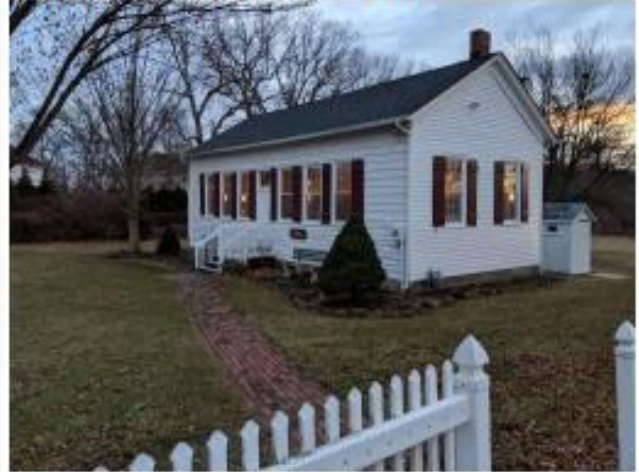
Old Wall Blansingberg School