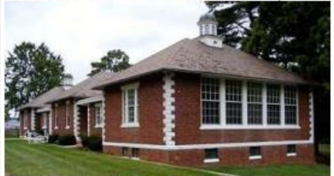
Court Street School Education Community Center

Corner Cedar Dr & Montrose Rd, Colts Neck