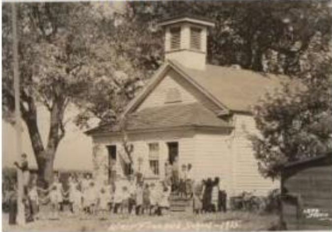
West Freehold Schoolhouse