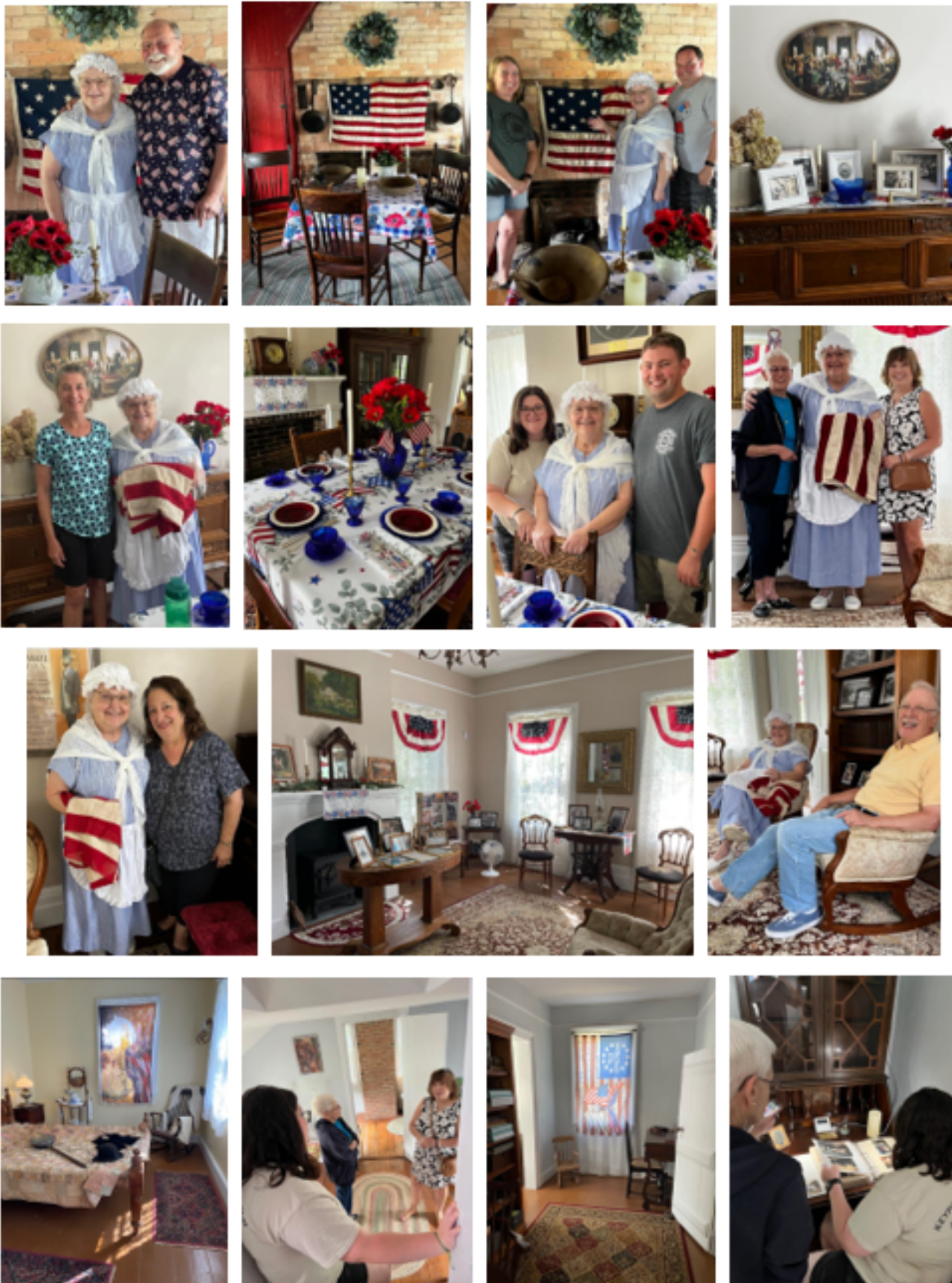
JULY OPEN HOUSE -1776 and pictures with Betsy Ross